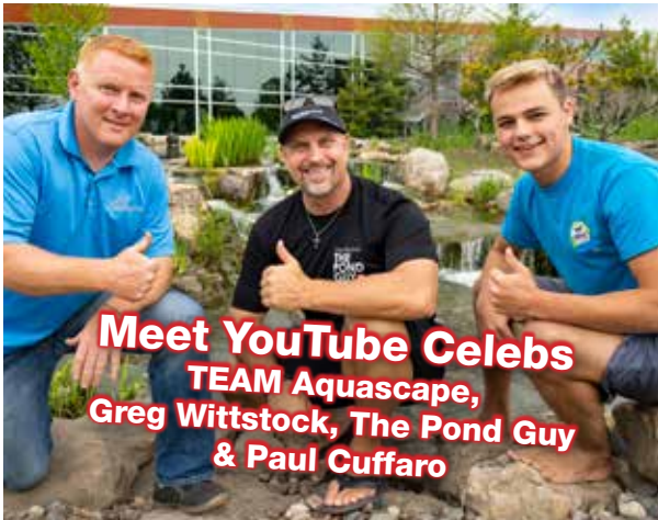
Meet YouTube Celebs TEAM Aquascape, Greg Wittstock, The Pond Guy & Paul Cuffaro

Learn how to install three beautiful water features when you attend Aquascape Pond Camp on June 22nd!